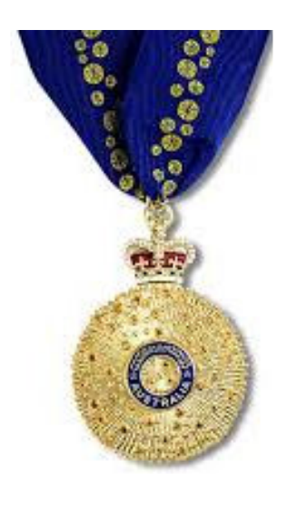
AC – Companion of the Order of Australia (Worn around neck) (Left)