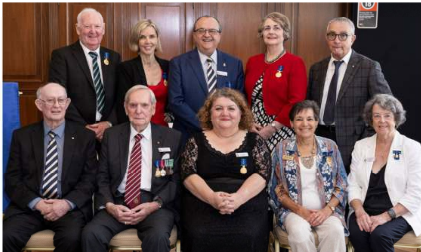
NSW Branch Committee 2024

The Order of Australia Association NSW Branch AGM was held on the 19th March 2024.